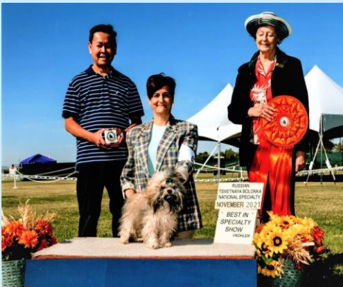
Bred-By Pink Lotus Kennels