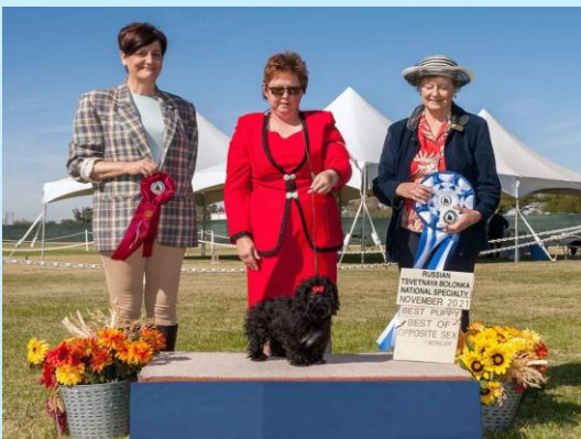
Bred-By Pink Lotus Kennels