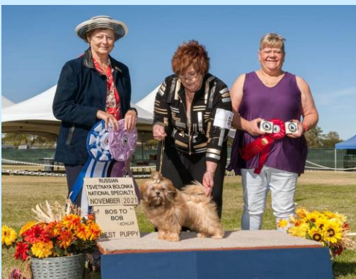
Bred-By Pink Lotus Kennels