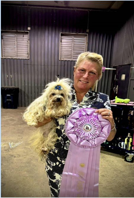
Best of Opposite Sex: Showboat's Etched in Steel